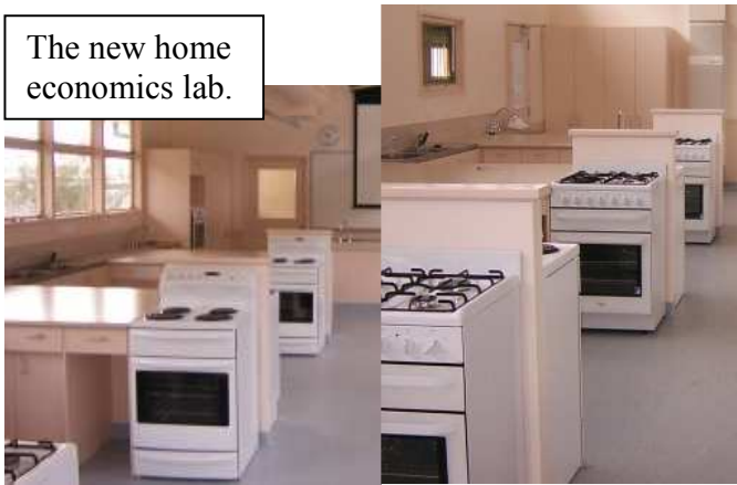
The new home economics lab.

It is very pleasing to see more frequent parental involvement than before. However, it could be quite challenging at times as we all have a busy schedule & are pre-occupied.